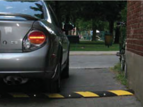
PICTURED: SPEED BUMP

Checkers<sup>TM</sup> is a full-service manufacturer of parking lot safety solutions. We design and manufacture traffic control products that help cars navigate and park safely. Our main goal has been to create solutions that protect motorists and pedestrians from the perils of today's parking lots. As such, Checkers<sup>TM</sup> products have been designed and developed with speed reduction, driver and pedestrian safety in mind. All our solutions are manufactured from 100% recycled rubber and plastic. Our speed bumps or parking blocks, for example, are longer lasting, highly visible, and more car-friendly than asphalt or concrete alternatives. Not only are Checkers<sup>TM</sup> traffic safety solutions environmentally friendly, they can also be installed for either temporary or permanent use.