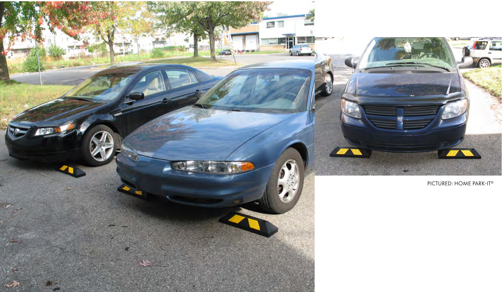
PICTURED: HOME PARK-IT®

Checkers™ is a full-service manufacturer of parking lot safety solutions. We design and manufacture traffic control products that help cars navigate and park safely. Our main goal has been to create solutions that protect motorists and pedestrians from the perils of today's parking lots. As such, Checkers™ products have been designed and developed with speed reduction, driver and pedestrian safety in mind. All our solutions are manufactured from 100% recycled rubber and plastic. Our speed bumps or parking blocks, for example, are longer lasting, highly visible, and more car-friendly than asphalt or concrete alternatives. Not only are Checkers™ traffic safety solutions environmentally friendly, they can also be installed for either temporary or permanent use.